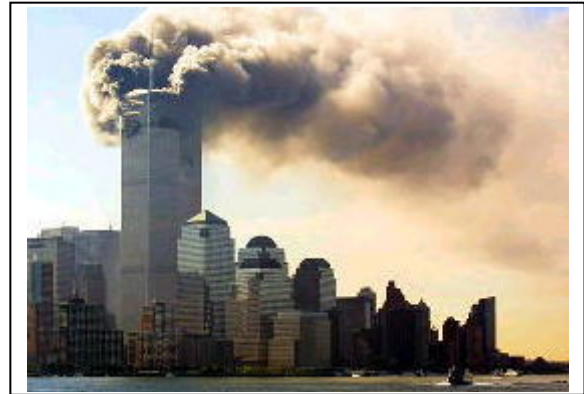
Attack to World Trade Center

Economic situation is also important. Disparity between developed countries and developing countries are large. Economic situation of present age is introduced.